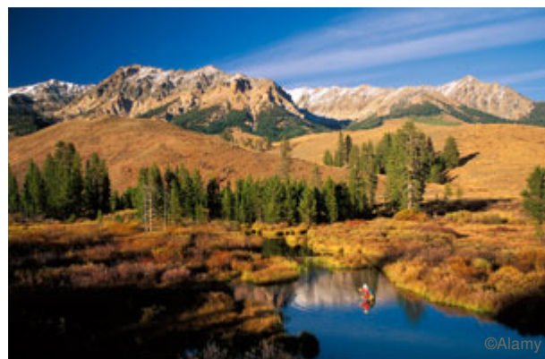
Second home: a log cabin in the mountains

Yes. We live in California and have a log cabin in the mountains.